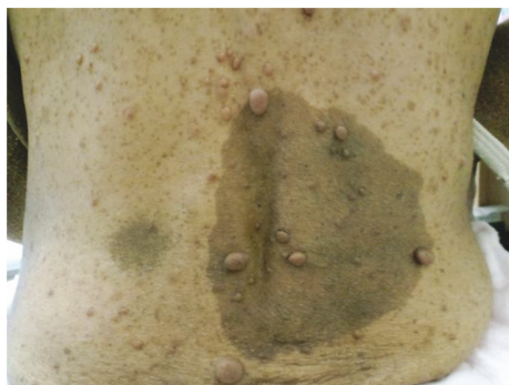
FIGURE 1: Patient with multiple cutaneous neurofibromatosis and café au lait macules.

vascular resistance (PVR) of 476 \text{ dyne}\cdot\text{s}\cdot\text{cm}^{-5} . Cardiac output (CO) was 4.0 \text{ L}/\text{min} and the cardiac index was 2.9 \text{ L}/\text{min}/\text{m}^2 . High-resolution computed tomography (HRCT) showed markedly enlarged central pulmonary arteries, upper-lobe centrilobular emphysema with multiple bullae, and bilateral ground-glass nodules with multiple cystic lesions in the lower lobe (Figure 2). A ^{99\text{m}}\text{Tc} macroaggregated albumin lung perfusion scan showed perfusion defects of bilateral upper lobes, and these defects matched emphysematous lesions of her lung. An obstructive pattern was observed in a respiratory functional test as follows: forced expiratory volume in 1 s, 1.86 \text{ L} (83% of predicted); forced vital capacity 2.88 (105.5% of predicted); and diffusion capacity of lung for carbon monoxide 3.6 \text{ ml}/\text{min}/\text{mmHg} (23.9% of predicted). The results of the tests for rheumatoid factor, antinuclear antibody, anti-scleroderma antibody, anti-smith antibody, anti-ribonucleoprotein antibody, and anti-Sjogren's syndrome A/Sjogren's syndrome B antibodies were all negative. The patient denied any history of diet drug use, human immunodeficiency virus risk factors, obstructive sleep apnea symptoms, or rheumatological symptoms.