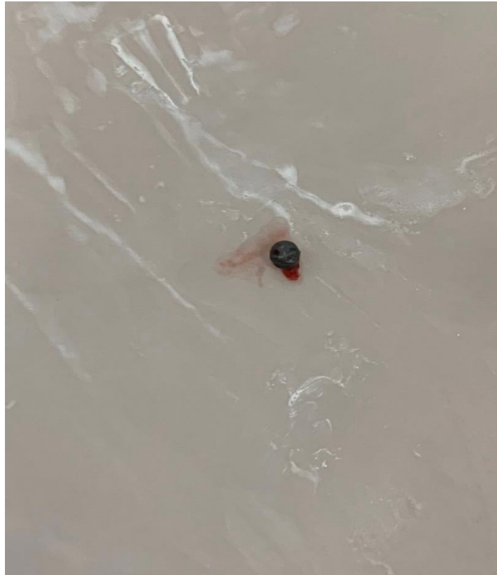
Photograph 2. Photograph showing 'gun pellet' removed in first case