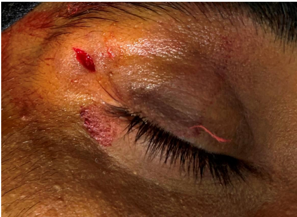
Photograph 3. Photograph of second case, after removal of subcutaneous gun pellet from the right upper eyelid