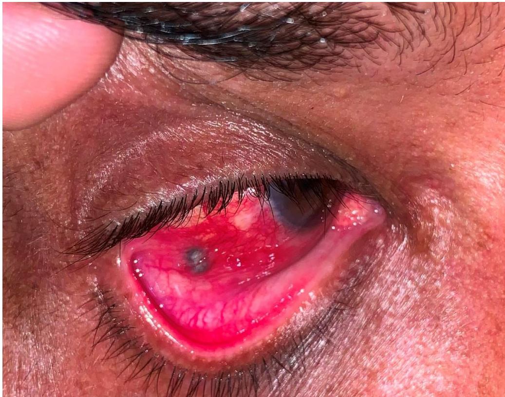
Photograph 1. Photograph showing subconjunctival gun pellet in first case

Second case a 27year old male also presented to the emergency room with a history of injury with pellet in his right upper eye lid (Photograph-3) on the same day during farmer’s protest. On palpation of the lid the foreign body was suspected. The BCVA in both eyes was 6/6. There was subconjunctival hemorrhage in the right eye. Intraocular pressure was normal in both eyes. Dilated fundus examination was normal in both the eyes. X-ray of the orbit was advised. A rounded metallic foreign body of size 2x2mm was detected on the x-ray (Photograph-4). The wound was explored and the pellet was removed from the right upper eye lid. The wound was sutured with 6-0 Vicryl.