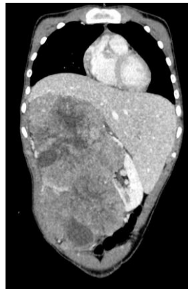
Fig. 1. Coronal view of contrast enhanced CT abdomen showing a right retroperitoneal mass clinically manifest as huge hepatomegaly

mass with area of haemorrhage and yellowish cut surface. The tumor was sharply demarcated from the renal parenchyma. Microscopically, this well-encapsulated tumour was composed of classical triphasic components: blastemal (40%), epithelial (30%) and stromal component (30%), consistent with nephroblastoma (Wilms' tumor) mixed type: Stage 1 (intermediate risk). Radiological staging confirmed of stage 4 disease with lung metastasis. Post operatively patient was then referred to Hospital Sultan Ismail, Johor Bahru for further treatment. He was under paediatric oncology care for 8 months in which he completed a total of 31 weeks chemotherapy and radiotherapy to abdomen and lungs. Reassessment CT post-chemotherapy show diseases progression with residual segment VII local liver disease and increasing number of multiple lung metastasis. Subsequently patient was referred to paediatric centre in Hospital Tunku Azizah, Kuala Lumpur (National Paediatric Center) for further expert management.