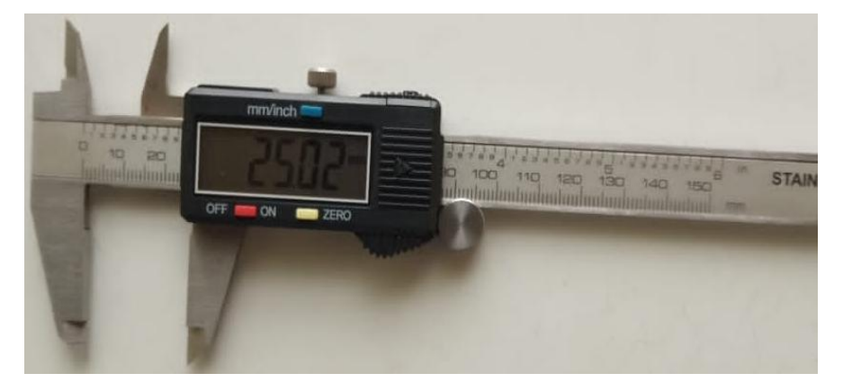
Fig. 1. Digital vernier caliper