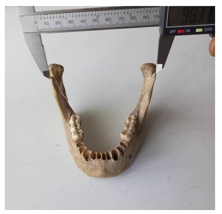
Fig. 2. Bicoronoid breadth measured using digital vernier caliper (mm)