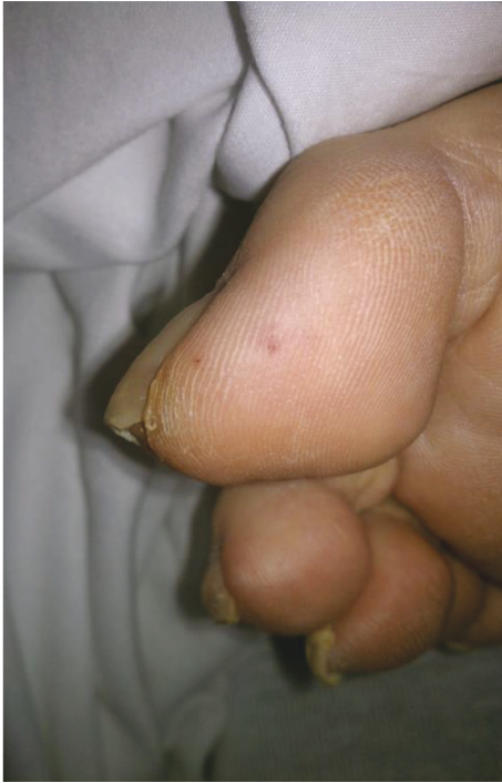
FIGURE 1: Right first toe with Janeway lesion (vascular emboli phenomena).