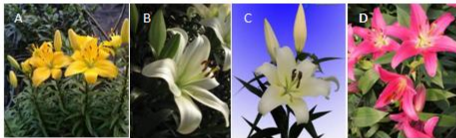
Fig. 1. A: A 'Val di Sole' B: LA 'Adoration' C: OT 'Ice Cube' D: O' Zantriana'