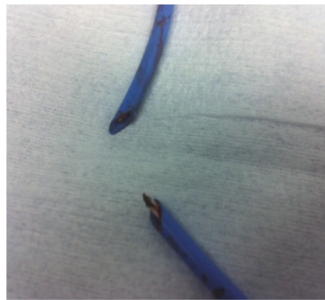
FIGURE 2: Severed nasal temperature probe.