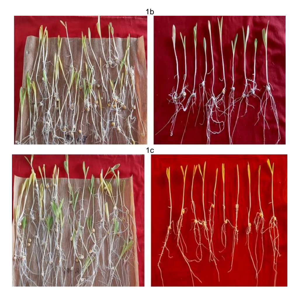
Fig. 1. Efficacy of seed dressing fungicides and bioagents against seed borne fungal infection and other seed quality parameters of maize by rolled towel method a) Carboxin 37.5% + Thiram 37.5% WP @ 2 g/kg seeds

b) Trichoderma harzianum @ 10 g/kg seedsc) Control (untreated check)