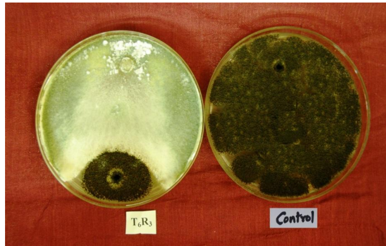
Fig. 2. Effect of native bioagent T. harzianum (MBNRT-3) on the growth of A. niger under in vitro conditions