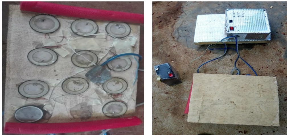
Fig. 1. The arrangement of piezo sensors and connections in the system

As piezo sensors power generation varies with different foot beats and weights of persons, multimeter was connected across for measuring voltages and current. Thus, varying forces were applied on the Piezo material; different voltage readings corresponding to the force were displayed. For each voltage reading across the force sensor, various voltage and current readings of the Piezo material were recorded as presented in Table 1.