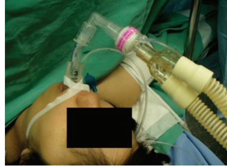
FIGURE 1: Insertion of the Parker tracheal tube and a nasogastric tube through the I-gel.

Laryngospasm and the risk of aspiration were our main concerns during the conduct of anesthesia in this patient. The sympathetic response to surgery may cause laryngospasm if the depth of anesthesia is inadequate. Use of topical anesthetics to blunt the sympathetic response had to be